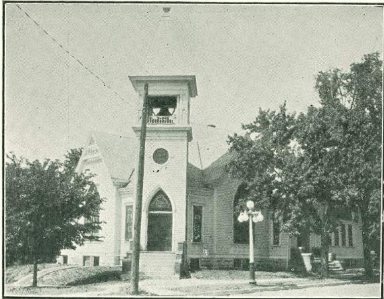
Remodeled Church Dedicated in 1932 The Church of 1950 Is Illustrated on Cover Page