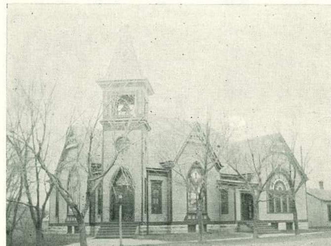
The New Church Dedicated in 1902